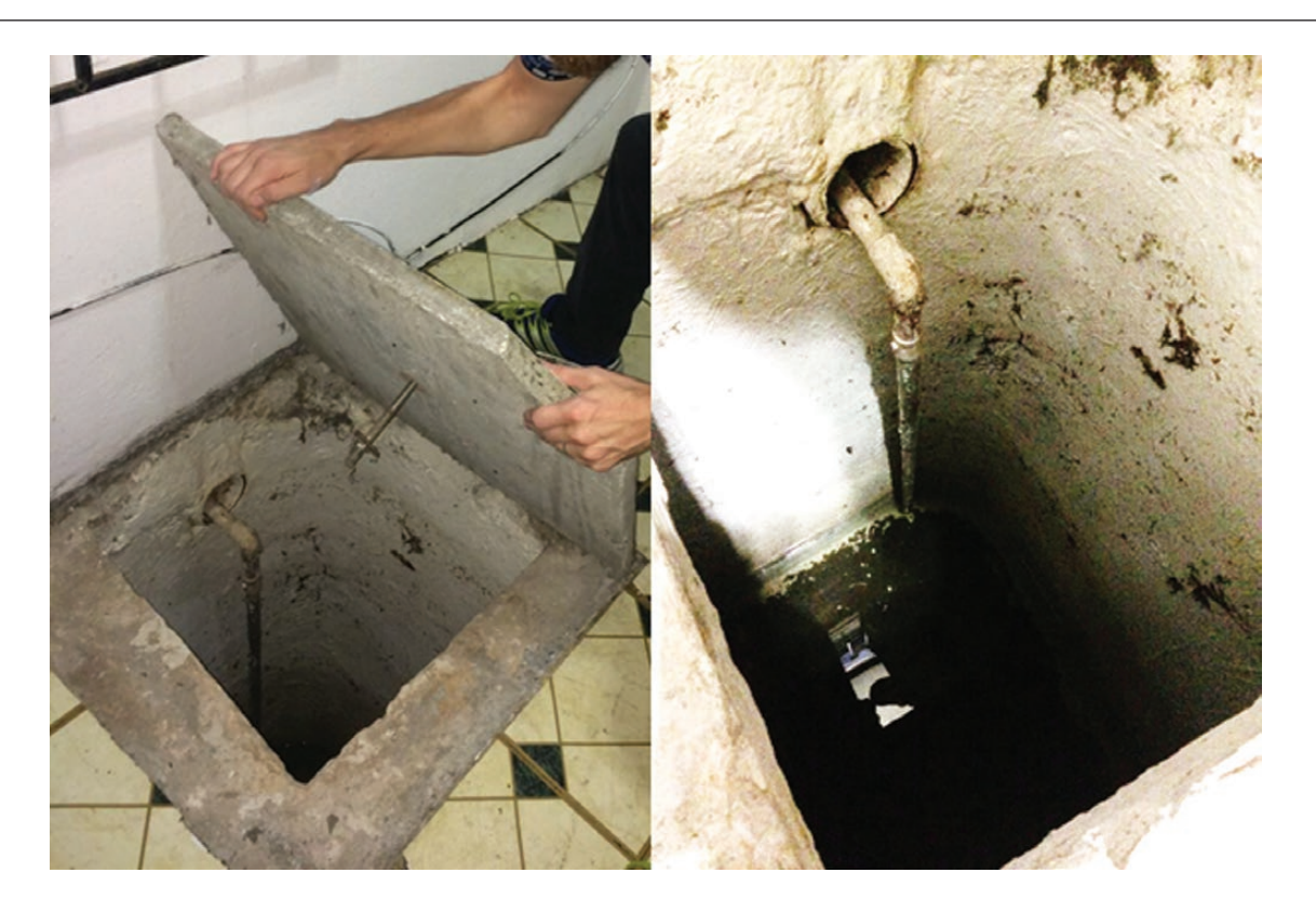
Figure 2. Household cistern epidemiologically linked to the index case of leptospirosis in the US Virgin Islands, 2017. Water collected from the cistern tested positive for pathogenic Leptospira spp., E. coli , and total coliforms.

The patient worked at a veterinary clinic where she cleaned flood water after Hurricane Irma in the week before symptom