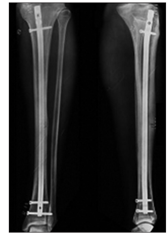
Figure 3: Followup X-ray of leg bones anteroposterior and lateral views of a patient in the nail group showing one of the proximal screws has been removed for dynamization

Demographics of the study participants are shown in Table 1. Considering the fact that the difference of "comminution" between two groups was statistically significant, correlations between study variables were evaluated and no significant relationships were observed, in particular for time to