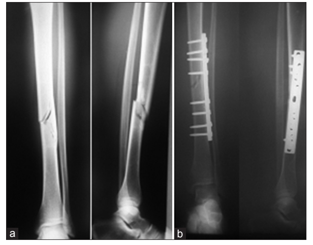
Figure 2: (a) Preoperative x-ray leg bones anteroposterior and lateral views showing fracture middle 1/3^{rd} tibia with intact fibula (b) Postoperative anteroposterior and lateral views showing plate in situ and union

Followup of patients was done at 2 weeks after the surgery and then monthly until union; after that every 6 months. In the intramedullary nailing cohort, dynamization was performed by proximal or distal screw removal (according to the location of fracture) if the union was not apparent after 3–4 months. If the union did not appear after 6 months, the case would have been considered a "nonunion" in both cohorts. Union was confirmed by observation of callus in the fracture site and by the ability of the patient to walk without pain and the support of a cane. Superficial infection was confirmed by clinical signs of erythema, swelling and hotness, and deep infection was confirmed by pus exudate. All the surgeries and followup visits were performed by a single surgeon.