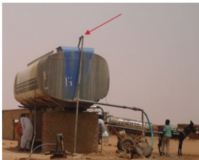
Figure 2 | Tank of well 1 with the modified radiator (red arrow).