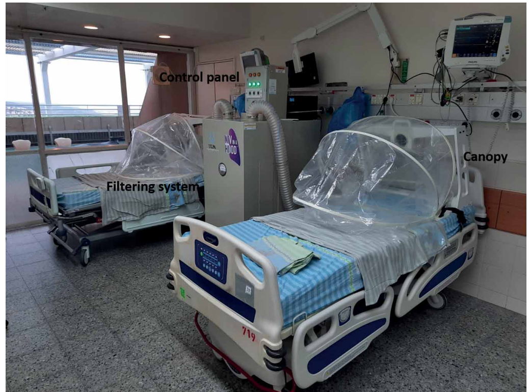
FIGURE 1 The constant flow canopy system.

In order to assess the satisfaction of the medical staff in the coronavirus unit with the system, we asked nine physicians and nurses to fill a short six-question questionnaire. The overall impression score of the system was 9.1 (out of 10).