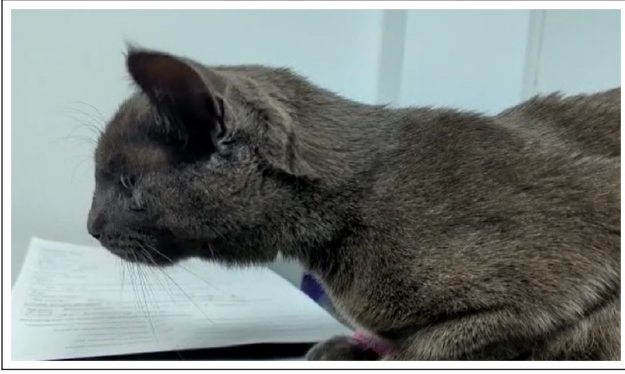
Figure 1 Extended-neck stance seen on presentation

It was suggested that a CT scan be performed, followed by potential endoscopy. However, owing to cost limitations, the decision was made to prioritise endoscopy over cross-sectional imaging. The cat was anaesthetised. A premedication of 0.3 mg/kg ketamine, 0.03 mg/kg medetomidine and 0.3 mg/kg methadone was given intravenously, and the cat was induced with propofol and maintained on oxygen and isoflurane. The larynx, tonsils, teeth, gingiva, tongue and hard palate were all examined and found to be of normal appearance. Otoscopic examination was unremarkable.