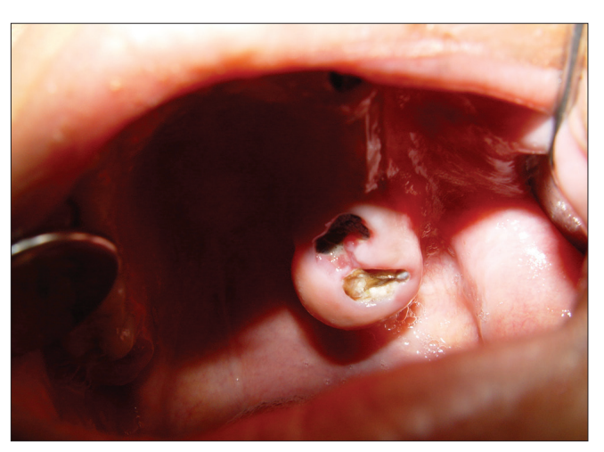
Figure 5: First offspring — palatal neurofibroma