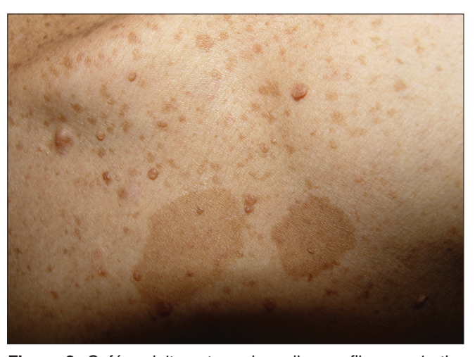
Figure 2: Café-au-lait spots and small neurofibromas in the third offspring