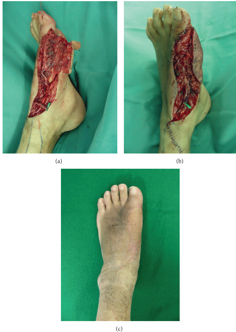
FIGURE 3: (a) Primary vein grafts were performed for an interarterial and 2 intervenous grafts. (b) Thrombosis was found in the primary vein graft between the comitant vein and the cutaneous vein. (c) Postoperative view 12 months after flap transfer with vein grafts.

was resected, and the contralateral small saphenous vein interposed the venous defect between the comitant vein and the healthy cutaneous vein. The congestion of the flap was ameliorated and survived. The osteomyelitis did not recur up to 12 months postoperatively (Figure 3).