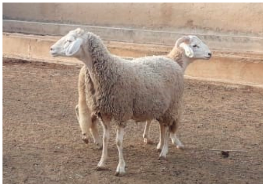
FIGURE 2: Ewe of Ouled-Djellal breed (18 months old) with its lamb.

the veterinary service at two slaughterhouses: Oujda (34°41'12" North, 1°54'41" West) and Jerrada (34°18'42" North, 2°09'49" West). The animals underwent a resting period under a water diet for 16–24 h before slaughter, and the slaughter procedure was carried out according to the Halal procedure. The carcasses were refrigerated in cold rooms for 24 h at 4 \pm 2^\circ\text{C} .