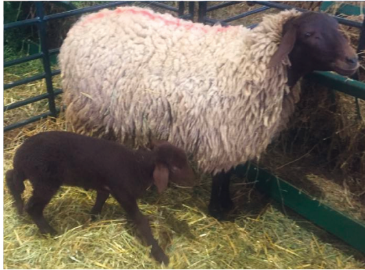
FIGURE 1: Ewe of Beni-Guil breed (18 months old) with its lamb.