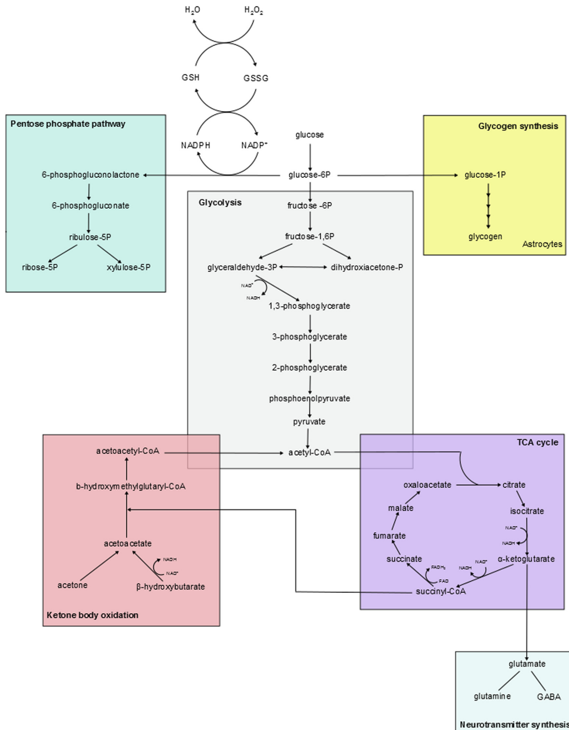
Fig. 2. Glucose use in the brain. Glucose is used for multiple functions in the brain. Glycolysis followed by oxidation of acetyl-CoA in the TCA cycle provides reduced equivalents that can be used by mitochondria to synthesize ATP. Alternatively, oxidation through the pentose phosphate pathway provides NADPH, required for the reduction of glutathione, a central anti-oxidant in the brain. Glucose is also required as a precursor to synthesize neurotransmitters, and can be stored to some extent in astrocytes in the form of glycogen. In the absence of glucose, ketone bodies produced in the liver can cross the blood–brain barrier and partially replace glucose as an energy source.

When FR is complemented with micronutrients, the diet can legitimately be considered “caloric restriction” (CR), since only calories are limited. Commonly, supplementation is performed by increasing the percentage of micronutrients in the diet to an extent equivalent to the calorie restriction imposed ( i.e. a 60% micronutrient