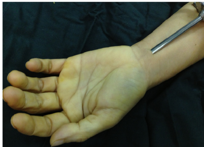
Figure 6. Incision in the modified endoscopic release surgical approach. The 1 cm incision was located in the proximal region of the transverse carpal crease and palmar longus tendon ulnar side.

invalid clinical test. Clinical tests included wound healing grade, incision infection rate, intraoperative complications, grip and pinch force, two-point discrimination, symptoms of sympathetic dystrophy and clinical symptom amelioration (Kelly). These tests were all performed by the same physician. Clinical efficacy was divided into cured, markedly effective, improved and invalid; clinical test results were divided into -, +, ++, +++, and the severity of pain symptoms is divided using 0-10 points for different levels of pain, 0 for no pain, 10 for severe pain. 0: No pain; 1-3 points: Mild pain, normal life, no sleep disturbance; 4-6 points: Obvious pain, unbearable,