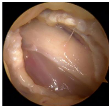
Figure 3. Intraoperative photograph of median nerve exposure. After the transverse carpal ligament was completely incised, the median nerve was exposed. This is a demonstration of the modified endoscopic release surgical approach.

Post-operative efficacy evaluation. The clinical symptom relief criteria were assessed according to the Kelly grading system (18). The differences in treatment efficacy were evaluated in a semi-quantitative manner (19). Semi-quantitative evaluation was performed by rating the outcomes using certain grades to obtain ranked data, e.g. regarding clinical efficacy, cases were rated as cured, markedly effective, improved and