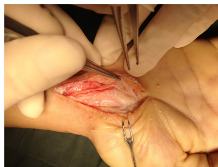
Figure 1. Intraoperative photograph of traditional incision surgery. An ~6-cm long S-shaped incision was made on the ulnar side of the thenar muscle crease. This is a demonstration of the open release surgical approach.

Observational indicators. Evaluations were performed the week prior to surgery and again at 4, 8, 12 and 52 weeks post-surgery, in addition to 4 years after surgery, with an average follow-up time of 33.6 months. In this extended follow-up, the observations included surgical operative time, hospitalization time, intraoperative secondary injury rate (the incidence of nerve, vessel and tendon injury), incision infection rate, post-operative scar pain score, the time required to resume a normal lifestyle, recovery of grip and pinch force, two-point discrimination 3 months following the operation, the symptom of sympathetic dystrophy and symptom amelioration (Kelly grading).