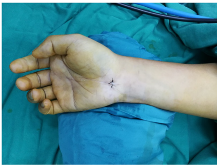
Figure 5. Intraoperative photograph. The incision was sutured following the surgery. The 1 cm incision made was located at the proximal end of the transverse carpal crease and palmar longus tendon ulnar side. This is a demonstration of the modified endoscopic release surgical approach.