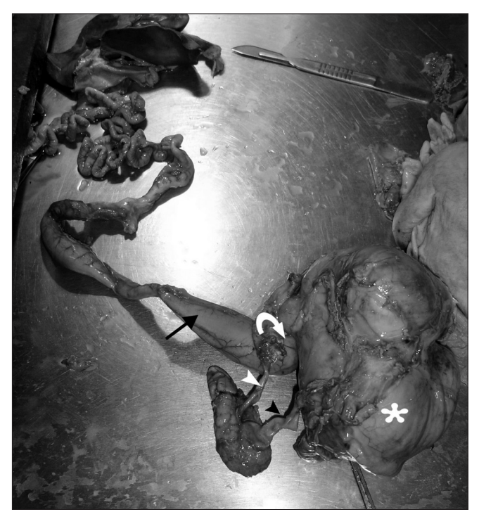
Figure 3: Postmortem examination reveals a large cystic mass lesion (asterisk), communicating with the dilated colon (arrow). The small bowel loops were normal. The right kidney is hydronephrotic, with double ureters (arrowhead) draining into the cystic mass. The left kidney was not seen