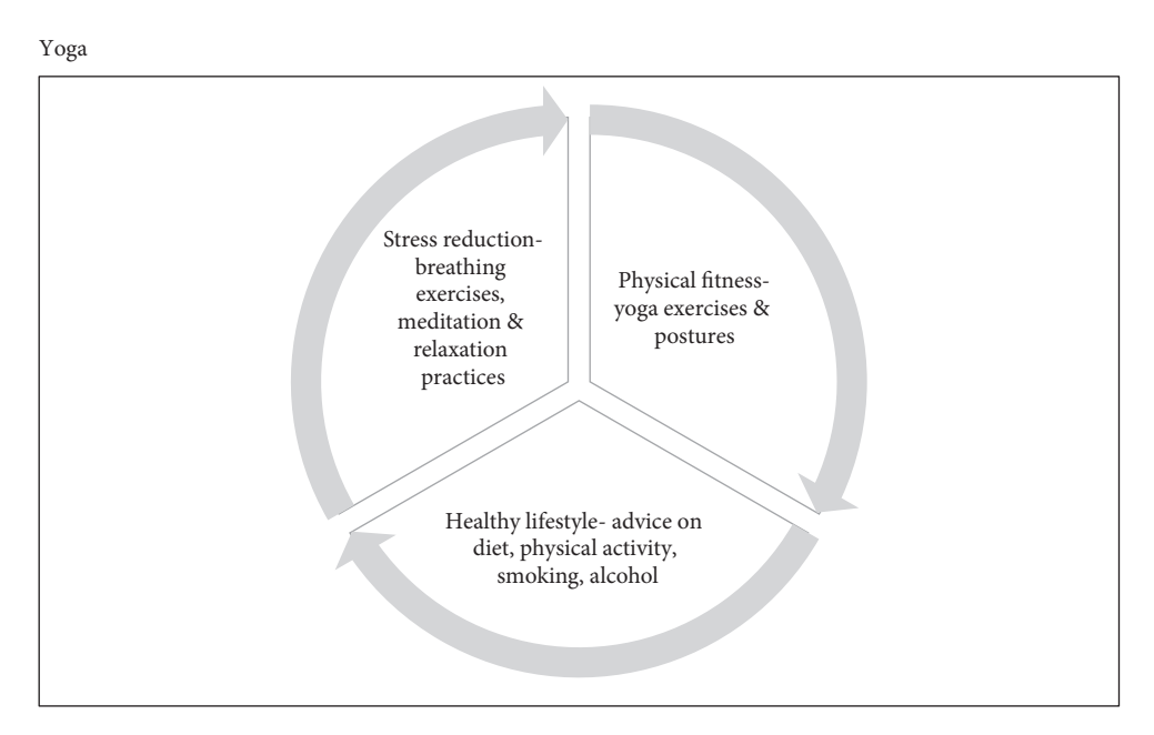
FIGURE 1: Similarities between CR and yoga.

After finalising the booklet for participants, it was also converted into a high-definition DVD to aid audio-visual learning. For this purpose, an external filmmaking company was hired in India.