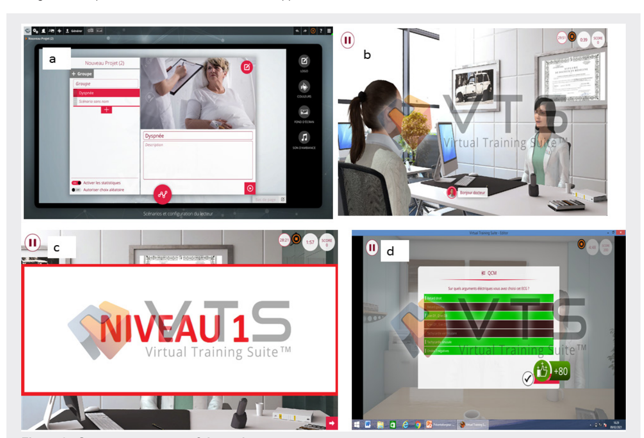
Figure 2: Some screen casts of the serious game

Each of the team has completed the game design successfully. The game design process has been evaluated. Some screen casts of a serious game designed by students is represented in figure 2.