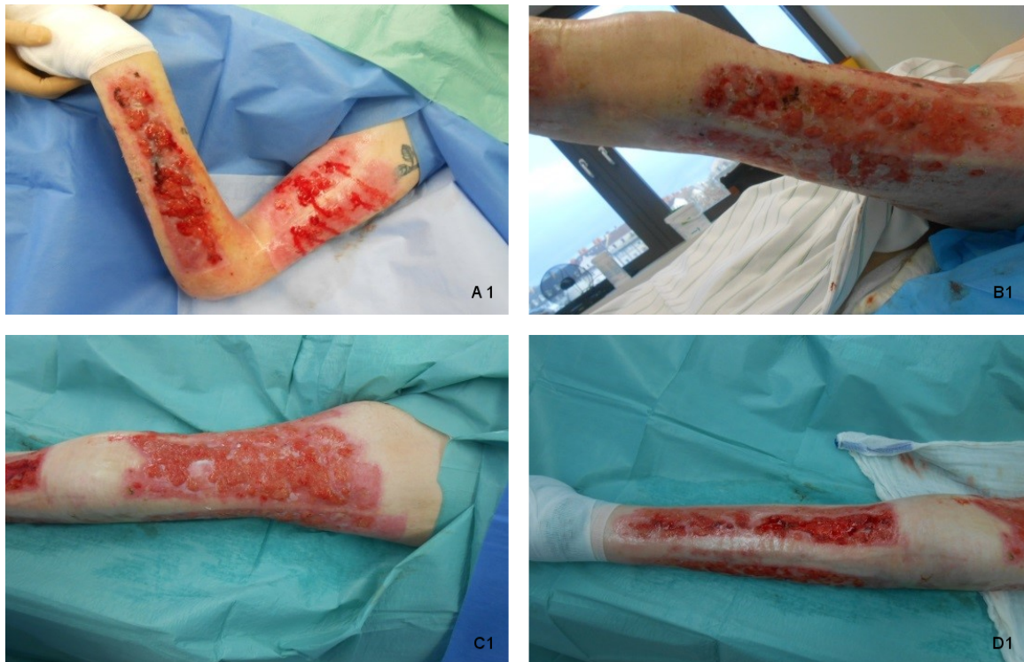
Figure 1: Severe healing disturbance with hypergranulation of the donor sites 8 months after split-skin transplantation operation in 61-year-old burn victim.

(A 1: left upper arm and left forearm, B 1: lateral and posterior parts of left thigh, C 1: anterior part of left thigh, D 1: left lower leg)