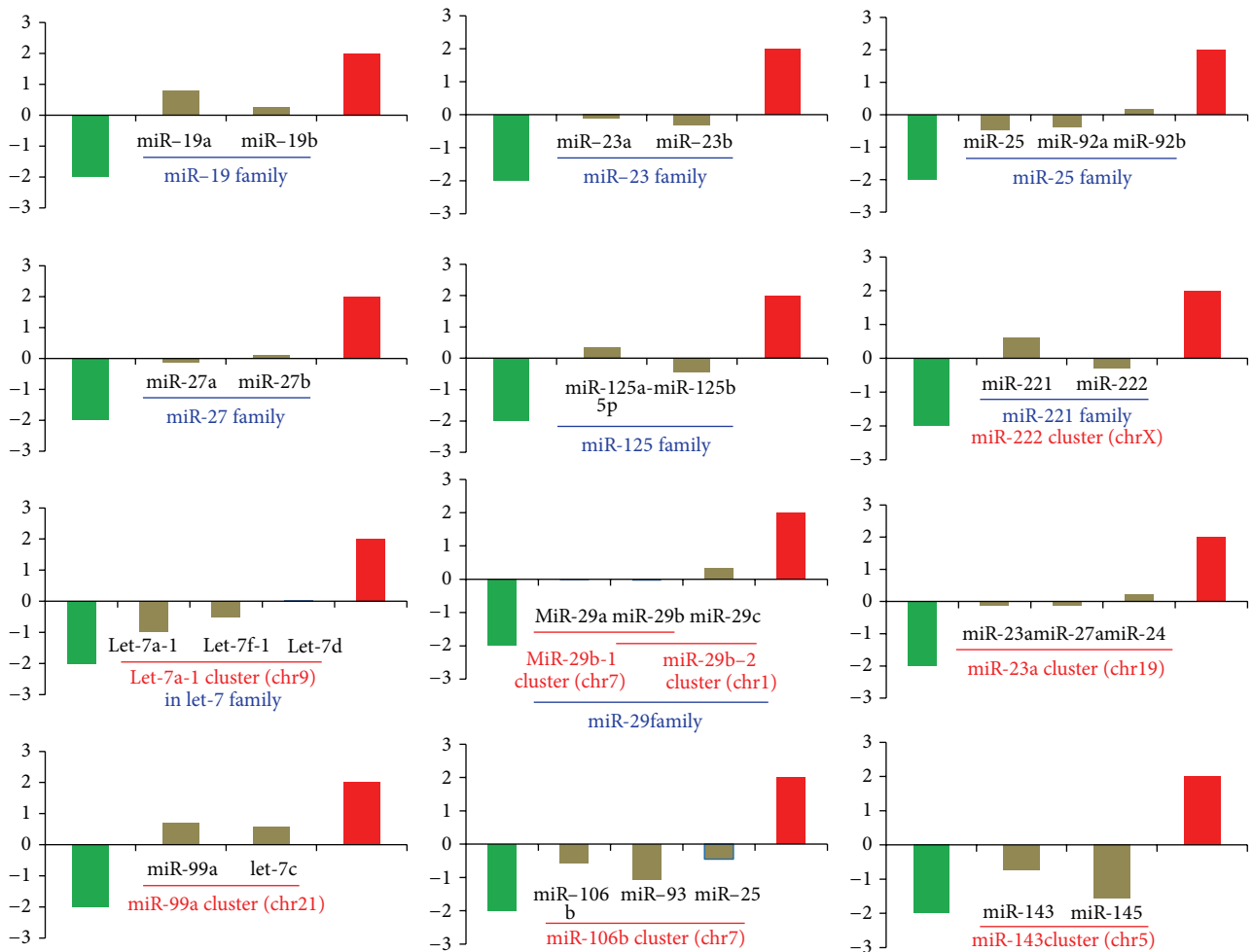
FIGURE 2: Examples of consistent or similar deregulation patterns in clustered and homologous miRNAs based on the equally mixed datasets. The horizontal axis indicates the miRNAs and the involved gene cluster and family, and the vertical axis indicates the fold change (log 2 ) based on the equally mixed datasets of tumor and normal samples. The green and red bars indicate the threshold values (2 and -2).