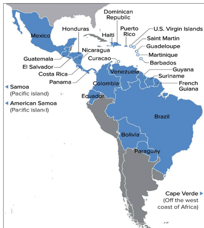
Figure 1: Countries in Americas with locally transmitted Zika virus disease

Beginning October 2015, suspected ZIKVD emerged, and by mid-October 2015, 165 cases were already suspected. The country's first ZIKVD outbreak was confirmed on 21 October 2015. By 6 December 2015, suspected cases of ZIKVD rose to 4744 which further increased to 7081 by mid-January 2016. Neurological complications were however not reported. [12]