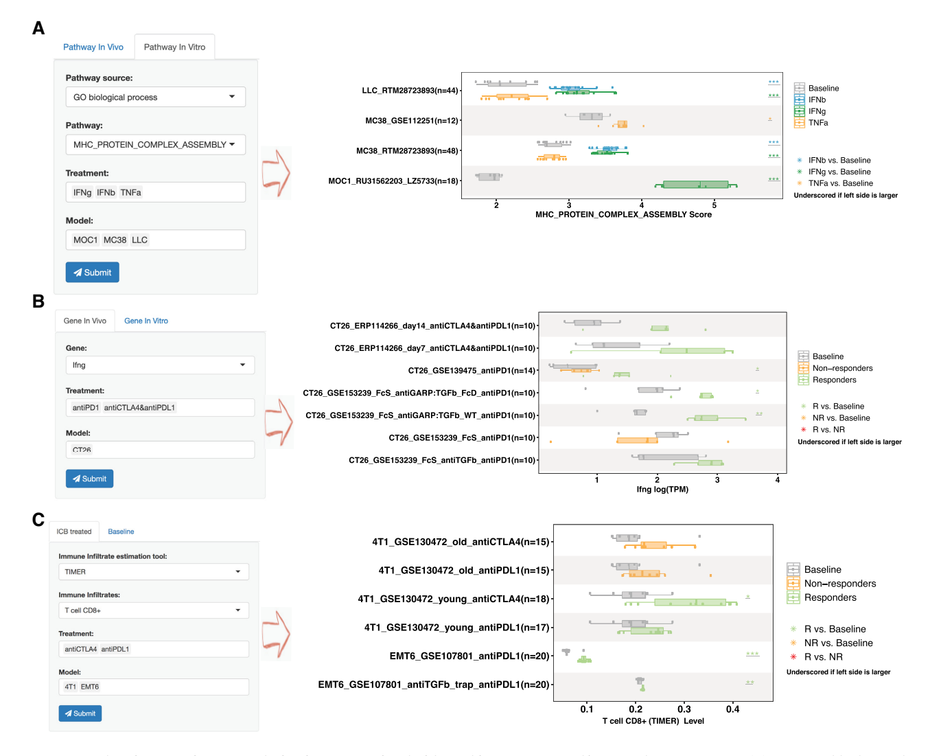
Figure 2. Examples of TISMO features exploring factors associated with cytokine treatment and immunotherapy response. (A) Users could select pathways, cytokines, and syngeneic cell lines to evaluate their expressions before and after cytokine treatment. (B, C) Users could select a gene (B) and immune cell infiltration (C) to evaluate whether its level changes upon ICB treatment, and compare it between ICB responders and non-responders. Immune cell infiltration levels were inferred by six different state-of-the-art deconvolution algorithms. The generated figures could be downloaded in jpg, pdf, and table formats.