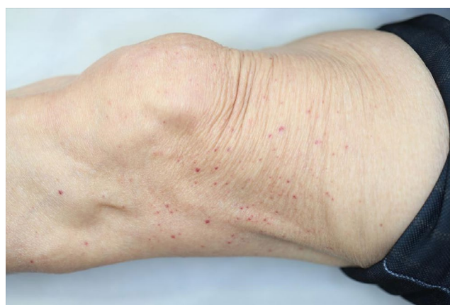
FIGURE 3 Picture of multiple erythematous lesions (arrow) on the patient on the day of hospitalization

considered drug-induced. Accordingly, allopurinol and AZA were discontinued, and daily injections of granulocyte colony-stimulating factor (G-CSF) were commenced. Fifteen days of continuous G-CSF injections were necessary for severe neutropenia recovery. Platelet transfusion was necessary twice during hospitalization because of thrombocytopenia. Profound stomatitis allowed only a small intake of a liquid diet, and morphine hydrochloride was used for pain control. CRP rebounded after falling to a low level once on day six of admission; consequently, CFPM was switched to doripenem (DRPM), and CRP went down again. Ultimately, 16 days of antibiotic and morphine hydrochloride administration were needed. She was subsequently discharged from the hospital on day 32 of admission with 600 mg of UDCA and 6 mg of PSL. However, recovery from stomatitis took six weeks and that from alopecia took six months. After investigating the genetic polymorphism of nudix hydrolase 15 ( NUDT15 , rs116855232), which is known to be predictive of AZA toxicity, it was revealed that she had the homozygous