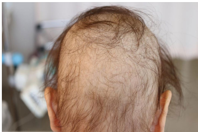
FIGURE 1 Picture of the patient's head with massive hair loss on day three of hospitalization

Given the clinical course and these results, the severe hematological toxicity and other physical findings were