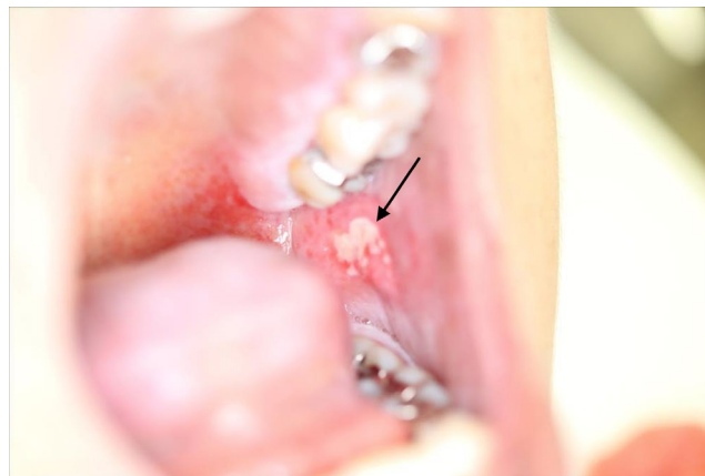
FIGURE 2 Picture of oral ulcers (arrow) of the patient on the day of hospitalization