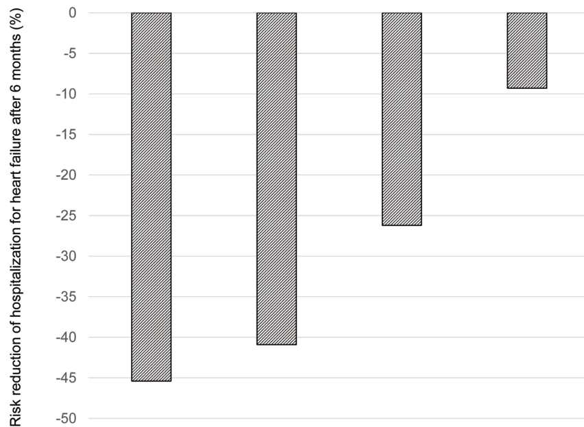
Figure 2. Risk reduction of the hospitalization for heart failure at 6 months after the start of sodium-glucose cotransporter 2 inhibitors (SGLT2i) in randomized controlled trials (RCTs) which included non-diabetic patients or not.