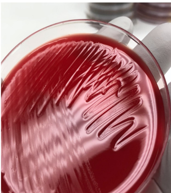
Fig. 2. Pinpoint colonies visible on CDC anaerobic agar.

Her aphasia improved significantly 2 days after starting appropriate therapy. She was ultimately sent home to complete an 8-week course of