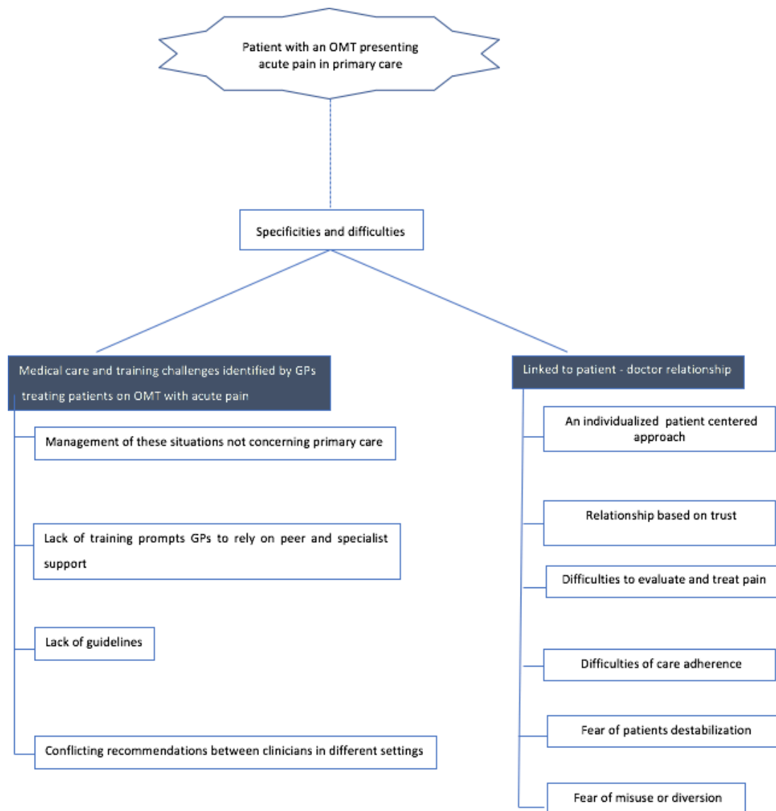
Figure 1 Specificities and difficulties for management of acute pain among patients under OMT in primary care—thematic analyses. GP, general practitioner; OMT, opioid maintenance treatment.

Many of the GPs reported lack of time for training. Some GPs identified inadequate training on the subject ‘I think we lack training on this subject’ (E5-l.275–278) and they described the desire for specific training to develop their knowledge about OMT and pain management. ‘I would be ready to learn more on this topic’ (E2-l.784). On the other hand, other respondents were at ease with pain management for patients on OMT: ‘I’m not a pain specialist at all, but it’s not a problem for me.’ (E1-l.546–547).