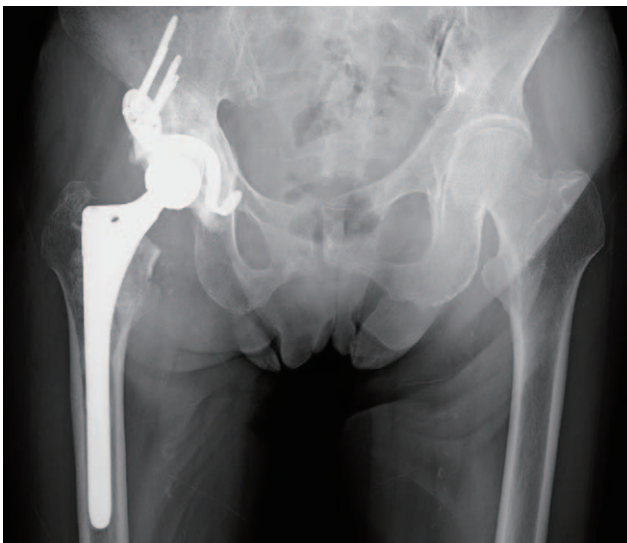
Fig. 2. A radiograph of the bilateral hips after revision total hip arthroplasty. An acetabular reconstruction with Kerboull-type plate and a calcar reconstruction with corticocancellous bone allograft and hydroxyapatite mesh-form sheet were performed.

procedure for septic loosening of the HA stem was conducted. The total revision rate was 1.5% (2/135). Six patients experienced asymptomatic sinking of the cementless stem, but no intervention was required (4.4%, 6/135). Only five non-survivors (3.7%, 5/135) presented with dislocation of the HA head; closed reduction was successfully achieved in all cases. No recurring dislocations requiring surgical intervention occurred. We observed intraoperative fracture only in non-survivors (Vancouver 30 type A:3, C:1). In three cases of Vancouver type A, these fractures were noticed during the HA procedure, and the patients were treated with additional cerclage wiring performed simultaneously. In the first postoperative radiograph taken immediately after the surgery, one patient with undisplaced Vancouver type C was diagnosed and treated conservatively. Overall, there were eight instances of postoperative periprosthetic fractures (5.9%, 8/135): four cases among survivors and four cases among non-survivors. Among the survivors, three cases were classified as Vancouver type A and