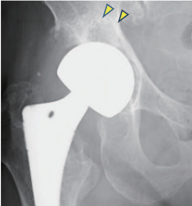
Fig. 1. A radiograph of the right hip of a 77-year-old female patient with a 15-year history of ipsilateral cementless hemiarthroplasty showing an osteolysis in the acetabulum (arrowheads).

hip before the index surgery and demonstrated painful osteolysis of the acetabular bone (Paprosky type 2B 29 ; Fig. 1 and 2). In one non-survivor, the Girdlestone