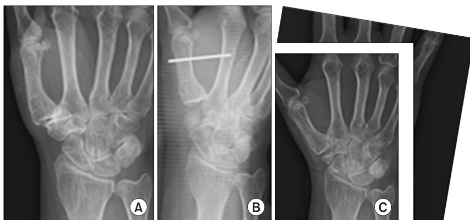
Fig. 3. Preoperative (A), 1-day postoperative (B), and 59-month postoperative (C) radiographs of a 63-year-old patient with trapeziometacarpal arthritis of Eaton and Glickel grade III.

* p < 0.01 , vs. preoperative. † p < 0.01 , vs. preoperative. ‡ p = 0.20 , vs. intermediate.