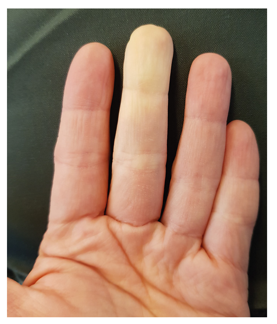
Fig. 1. Raynaud's phenomenon. Well-demarcated, white-pale, cold areas affecting the middle finger of the left hand of a 31-year old, otherwise healthy, woman.

visits after 4, 8, and 12 weeks, the patient was symptom free and did not report additional episodes. Whether this could be considered as complete recovery or attributed to the rising temperatures in spring is yet unknown. Further evaluations in the colder months are required.