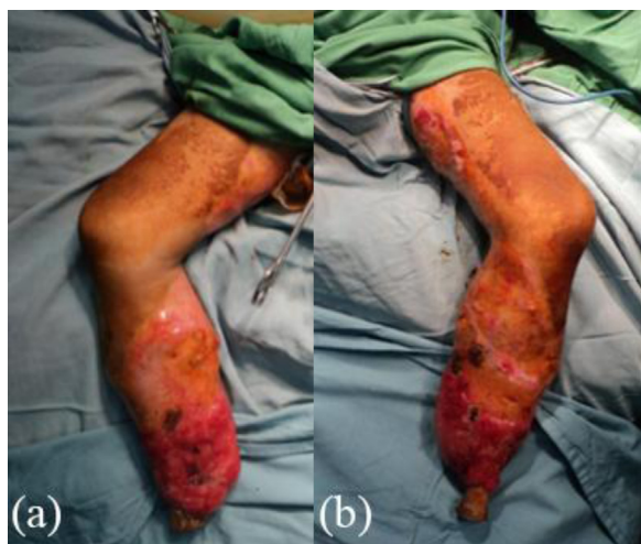
Fig. 3. Bilateral Autoamputation of the patient's lower extremities showing both tibial stumps with exposed bones surrounded by dry necrotic tissue.