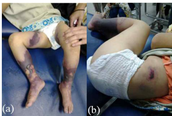
Fig. 1. (a), (b) The patient's lower extremities showing bluish and dark bruises with clear demarcation above the ankles.