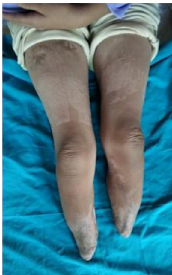
Fig. 5. The patient's Lower Extremities after debridement.