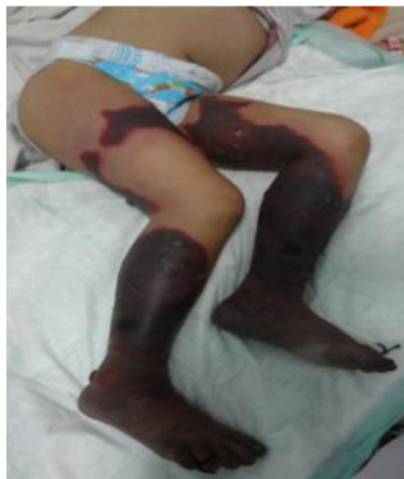
Fig. 2. Bilateral necrosis of the patient's lower extremities involving the pedal and tibial area with some areas of the thighs affected.

bone ends were exposed and dry. The patient was alert but looked malnourished. Unfortunately, the parents denied further treatment once again due to financial circumstances. Two months later, the patient was admitted to the surgical ward by the city council to receive prostheses. In spite of the cutaneous gangrene up to the thigh areas, there weren't any signs of any further propagation of the disease since her last admission. Physical examination showed autoamputation of both legs above the ankles without any signs of sepsis. Both knees were held in a slightly flexed position with adduction of both hips. Fig. 3 shows that both stumps had exposed bone with surrounding necrotic tissue. The lower extremities X-Ray results do not show any signs of destruction of the bones and their surrounding soft tissues as shown in Fig. 4. Debridement of necrotic bone and soft tissue and skin grafting was performed to cover the exposed tissue and bone ends. The child was subsequently fitted with patella tendon bearing prostheses. In the present day, 5 years after the operation, the patient is currently in a healthy condition without any additional complaints and is grateful that she is able