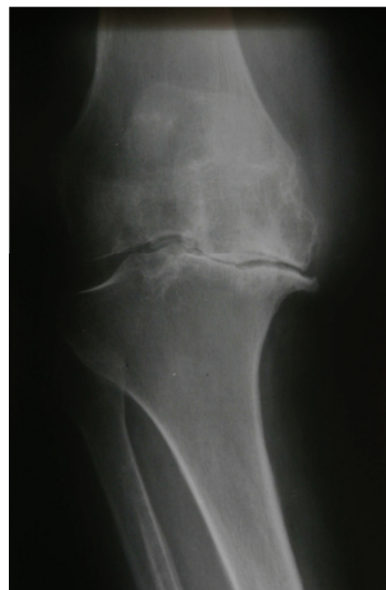
FIGURE 2: Osteoarthritis of the knee (3° of Altman scale, anteroposterior fluoroscopic view).

In the beginning of observation and during pharmacotherapy, the physician evaluated the degree of reduction of joint function based on main disease symptoms (pain in the beginning of movement, pain at movement/joint load, fatigue pain, and feeling of tension/stiffness), noted down the first improvement of joint function, and evaluated treatment result after its end (in a scale: very good, good, moderate, no change, and deterioration). The end of treatment was a procedure of plastic surgery with endoprosthesis of the damaged joint in every patient. bioethics commission approved the study.