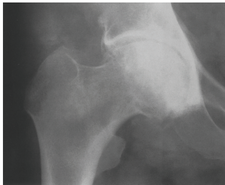
FIGURE 1: Osteoarthritis of the hip (3° of Altman scale, anteroposterior fluoroscopic view).

Description of the Intervention. After inclusion into the study, the patients in the first week of treatment received paracetamol + tramadol in generally recommended doses. Insufficient pain and clinical symptoms control qualified for stopping current treatment and inclusion of transdermal fentanyl in the following week with a release of 25 mcg/hr of the active substance. The patches were replaced every 72 hours. Participants were encouraged to take metoclopramide (supplied as 10 mg tablets) immediately if they experienced any nausea or vomiting. They were also encouraged to take a laxative if they had constipation.