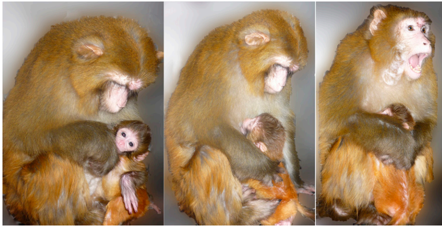
Fig. 1. Typical maternal behavior of a rhesus macaque. Female is holding ( Left ), nursing ( Center ), and protecting her infant from the perceived threat of the author coming near her enclosure ( Right ). Most monkeys in our colony respond to familiar humans by indicating a desire for a scratch or expectation of a treat; mothers with infants are extra-defensive (10, 18) and will initially show aggression for a few seconds then calm down and accept treats. The infant in these photos is monkey B2, whose behavior as an adult is described below.

the towels and were distressed when the cloths were removed for cleaning (11). These laboratory-reared monkeys were larger and healthier and had a higher survival rate than infants left to the care of their monkey mothers, as long as they had a soft cloth; without the cloth, survival was lower.