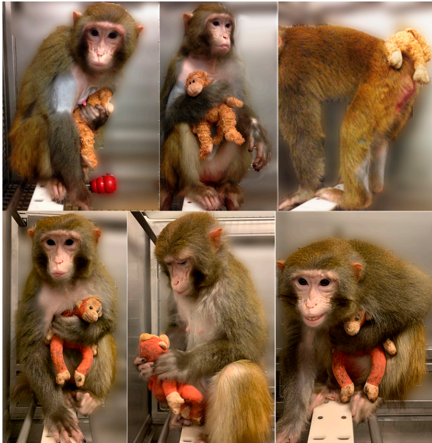
Fig. 3. Monkey Sv with adopted soft toys after her first parturition ( Top ) and her second ( Bottom ). The top row shows her still carrying around a toy 3 wk post-parturition. The leftmost panel shows a red kong that was not chosen, and the rightmost panel shows her carrying the toy on her hips, a typical maternal behavior, but, as with live infants, the mother usually quickly grabs the infant back to her chest whenever anyone approaches, so it was difficult to get a picture of this. The bottom row shows the same monkey 3 wk after her second parturition; she chose this reddish toy over a brown one on the morning after birth.

child-rearing philosophy, so that nowadays parents are encouraged to hold and cuddle their children—to do otherwise would now be considered cruel. My observations indicate that the post-partum maternal attachment drive can also be satisfied by holding a soft inanimate object. The calming effect of the toy on monkey Ve was dramatic, and using such surrogates may be a useful technique for relieving the stress associated with infant death or removal in captive primates (24).