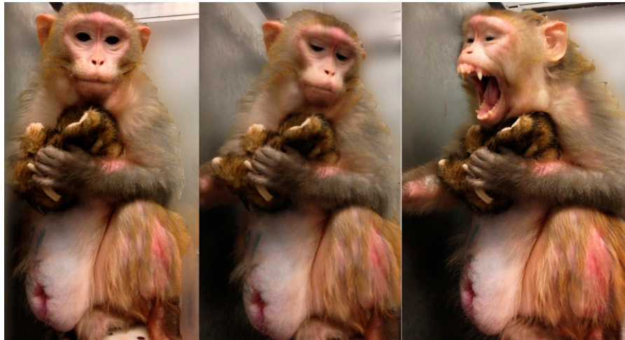
Fig. 2. Female monkey Ve showing maternal behavior toward a stuffed toy mouse 2 and 3 d postpartum. She continuously holds the toy ( Left and Center ) and protects it from the perceived threat of the author approaching her home enclosure.

after waking up from anesthesia. After one of the toy-adopting births, I had left both a soft toy and a similar-sized rigid pink baby doll in the monkey's enclosure, and after another a kong toy along with the soft toy; in both cases the soft toy was picked up and carried around, not the rigid baby doll or the hard kong. In one case a brown Beanie Baby (a "monkey") and a reddish one (an "orangutan") were offered simultaneously, and the redder one was chosen and carried around for months (Fig. 3, Bottom ). These stuffed toys matched a normal infant only in size, color, texture, and crude shape but did not possess any other infant characteristics such as odor, vocalization, movement, grasping, or suckling.