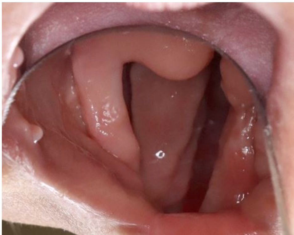
Fig. 1: Wide palatal cleft in patient with RHS. Note: large inferior turbinate was obvious.

The authors certify that they have obtained all appropriate patient consent forms. The patient has given her consent for her images and other clinical information to be reported in the journal. The patient understands that her name and initial will not be published and due efforts will be made to conceal her identity, but anonymity cannot be guaranteed.