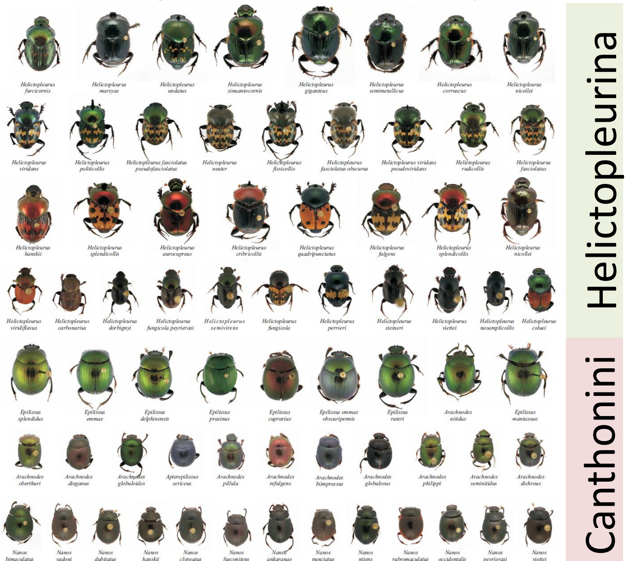
© 2011 by the authors; licensee MDPI, Basel, Switzerland. This article is an open access article distributed under the terms and conditions of the Creative Commons Attribution license (http://creativecommons.org/licenses/by/3.0/).

Madagascar has an exceptionally rich fauna of nearly 300 species of dung beetles (Scarabaeidae) of which 96% are endemic. Most species occur in forests and belong to the endemic subtribe Helictopleurina with one genus (Helictopleurus) and to the tribe Canthonini with several endemic genera.