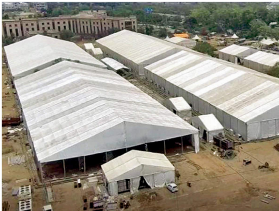
Fig. 2. Aerial view of 1000 bedded (including 250 bedded ICU) Hospital.