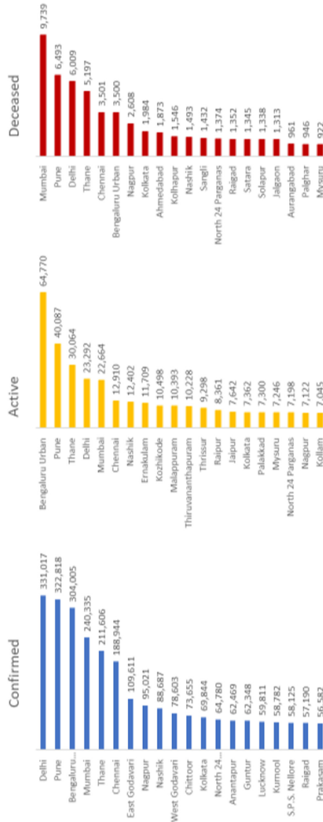
Fig. 1. Top 20 districts with COVID-19 burden in India (as per WHO - India situation report -38).