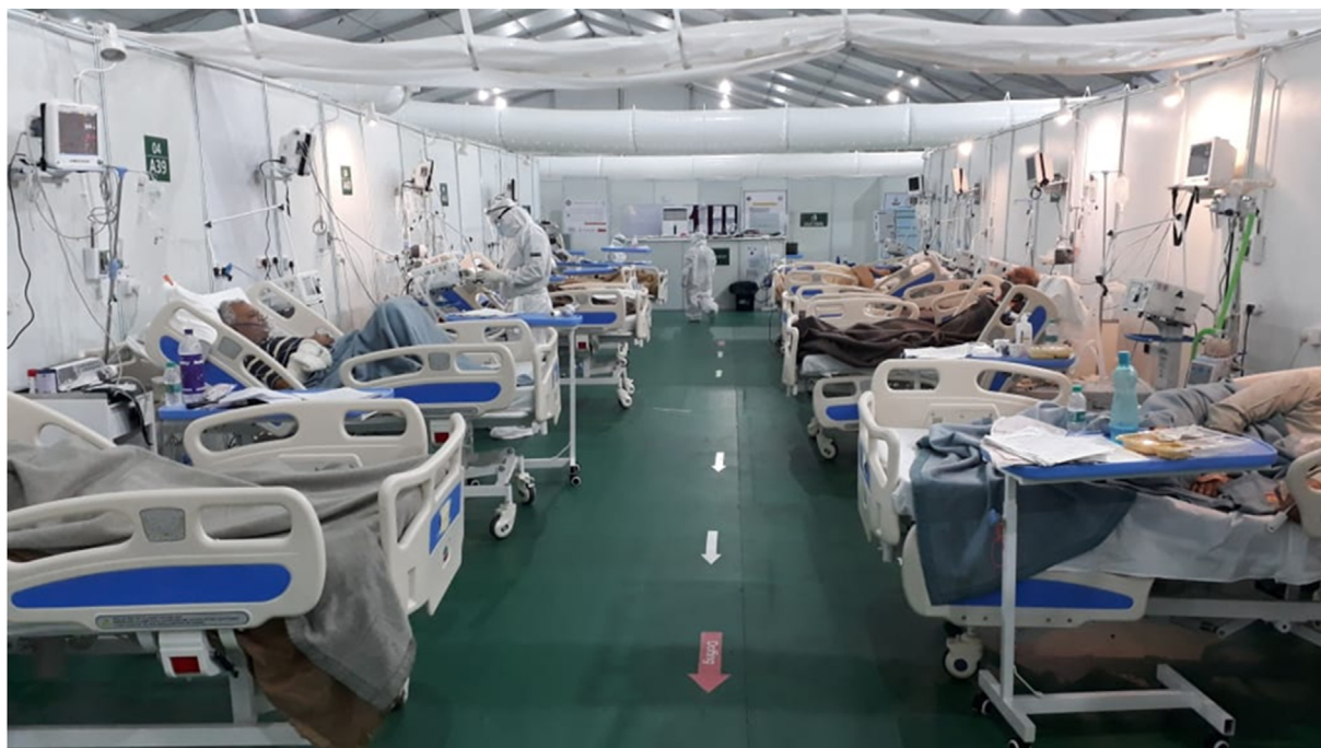
Fig. 4. Functioning intensive care unit of the COVID hospital.

hospital. The measures are taken for this included building the hospital on a raised platform, construction of a perimeter drain, and protection boards or coatings at the entrances of the hangars. It is recommended to keep the noise levels inside an ICU below 45 A-weighted decibels (dBA) during the daytime and 20 dBA at night [8]. Measures were taken to reduce noise levels inside the ICU by directing noise-generating machinery away from the patient care area, and the use of barriers.