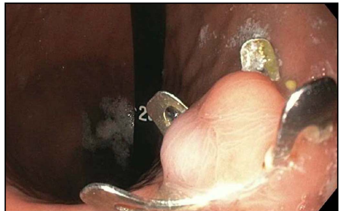
Figure 4. Endoscopic imaging of the resection site after 3 months with an over-the-scope clip still in place.

eFTR offers a minimally invasive procedure with good clinical outcomes. 2 Two different eFTR techniques are reported. The first one is the free-hand eFTR in which an endoscopic submucosal dissection full-thickness resection is performed first, followed by a gastric wall defect closure. The other eFTR technique is the device-assisted technique in which patency of