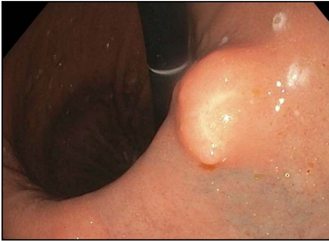
Figure 1. Endoscopic imaging of the lesion before resection.

intraoperative, early, or delayed complications. The patient was discharged the same day on an oral proton-pump inhibitor. Histopathology revealed fibrotic nodule with complete resection (R0), with the absence of muscularis propria (MP) (Figure 3). A follow-up endoscopy at 3 months revealed no recurrence (Figure 4).