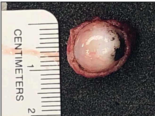
Figure 2. The lesion after resection.

Submucosal gastric tumors are frequently encountered during upper endoscopy. Most of these tumors are benign. However, tumors arising from the MP can have malignant potential. 3 GIST is the most common tumor originating from the MP of the stomach. 3 Malignant transformation of GISTs has been reported in up to 30% of cases. 4,5 Therefore, full-thickness resection of these lesions is required. The American Society for Gastrointestinal Endoscopy (ASGE) and the National Comprehensive Cancer Network guidelines (NCCN) recommend removing lesions that are symptomatic, larger than 2 cm, and/or contain high-risk features of GISTs (irregular border,