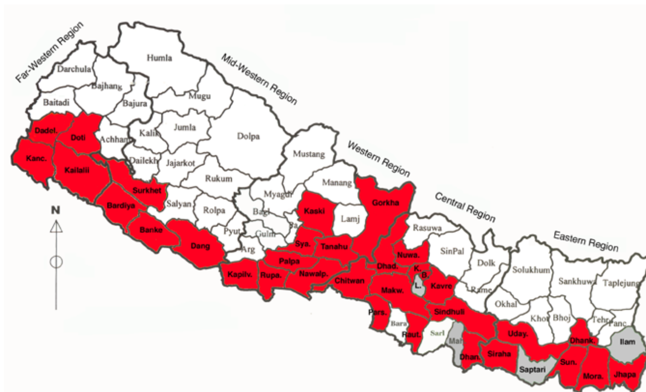
Figure 1 Administrative districts of Nepal, showing the extent of the mapping exercise. Districts found positive are coloured in red, districts found negative in grey.

and travel history within the year. Nearly 44% people said that they had visited other places, mainly Terai/India where they had spent at least one week. There was no statistically significant difference in ICT positivity between the group who had a travel history and the group who did not ( P > 0.005 ).