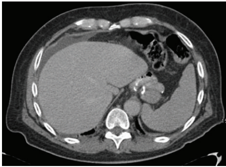
FIGURE 1: CT showing free fluid in the right paracolic gutter, no free air, and intact gastrojejunal anastomosis.

or duodenum, the decision was made for laparoscopic exploration.