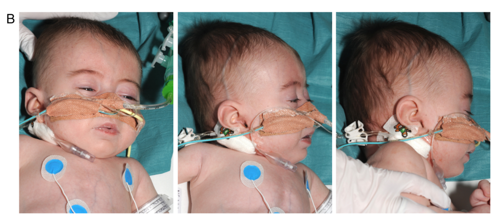
Figure 1 Continued

patient 1 and the three unaffected siblings of patients 8 and 9 confirmed the homozygous genotype segregates with a clinically affected status.