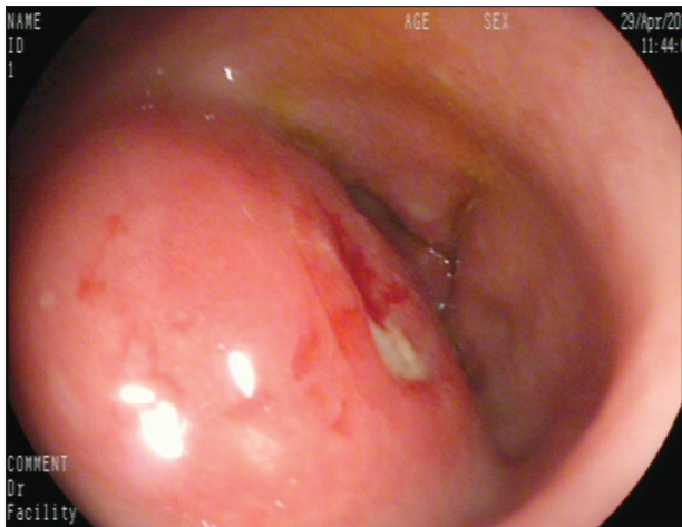
Figure 1: Gastroscopy-deformation of sinuses ventriculi, spherical protrusion lesions about 6 cm × 6 cm, the surrounding mucosa is smooth, with small ulcer formed on the top (EG-2990i-70).

SEMs begins with the initial endoscopy. The final diagnosis depends on histopathological examination. Endoscopic resection, endoscopic ultrasonography (EUS)-guided fine-needle aspirations (FNAs), EUS-guided core needle biopsy are necessarily required. EUS-FNA-based cytology is safe and has only limited value for the differential diagnosis of submucosal tumors. [2] To harvest sufficient material, it is necessary for us to have an exploratory laparotomy. Differential diagnoses of sub-epithelial gastric masses include benign and malignant. GIST is a relatively frequent mesenchymal tumor of the gastrointestinal tract with an annual incidence estimated at 10–20/million. [3] GIST is usually found incidentally by endoscopy or radiographic examinations, in 4%–39% of cases. [4] The clinical manifestation of GIST is variable. Endoscopy shows the characteristic of SEMs including hemispherical apophysis with or without bridging fold. If the diameter is more than 6 cm, the tumors are usually accompanied by central necrosis. [4] EUS plays a crucial role in diagnosis. EUS shows low echo and homogeneous mostly located muscle layer, but inhomogeneous, choice or high echo when tumors are possibly malignant. [5] The therapy depends on the histology. The highly curative option is surgical resection including open or laparoscopic surgery. [6]