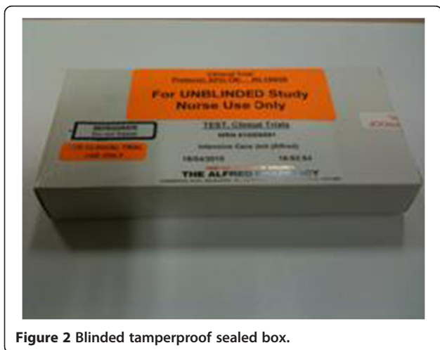
Figure 2 Blinded tamperproof sealed box.

Following patient randomisation by the site investigator or designee, an unblinded trial pharmacist will dispense the trial drug in a tamperproof sealed opaque box (Figure 2) to blind the treatment assignment. The box may only be opened by the site's designated unblinded trial dosing nurse. For patients who receive the active treatment the sealed box will consist of one Epoetin alfa 40,000 IU pre-filled syringe labelled with direction for use 'Inject 1 ml subcutaneously over at least 1 minute'. For patients who receive the placebo the sealed box will consist of one sodium chloride 0.9% 10 mL ampoule labelled with direction for use 'Inject 1 ml subcutaneously over at least 1 minute'.