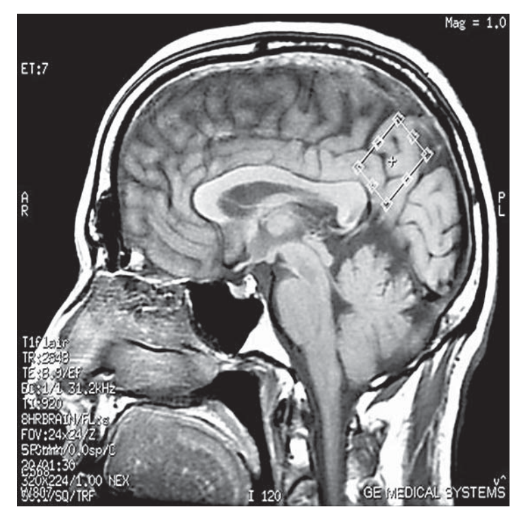
Fig. 1. Mid-sagittal precuneus and posterior cingulate region <sup>1</sup>H MRS voxel positioned with the long axis parallel to the parieto-occipital sulcus.

Gordon et al.: An Open-Label Exploratory Study with Memantine: Correlation between ^1\!H MRS and Cognition in Patients with Mild to Moderate AD