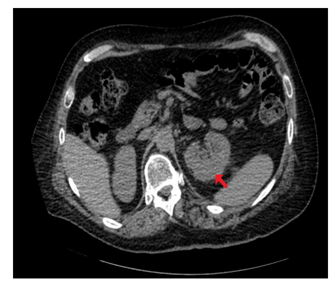
Figure 6 CT of kidneys.

Note: Performed 14 weeks after the third ureteroscopy, axial section, left renal subcapsular collection is much reduced in size, now measuring about 3×2 cm along the outer posterior aspect toward the upper renal pole (arrow). Abbreviation: CT, computed tomography.