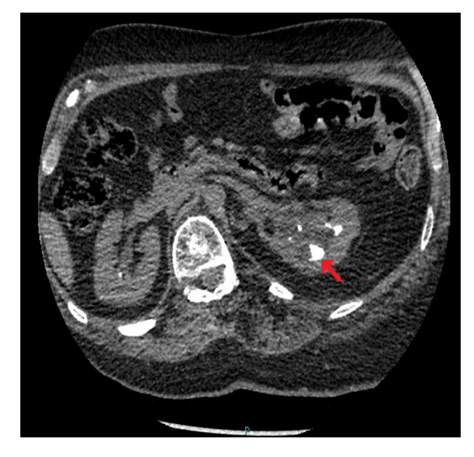
Figure I CT of urinary tract.

Note: Performed 3 weeks after the second ureteroscopy, axial section: residual stones in individual calyces, two of them quite large, the largest measuring \sim 19 mm in diameter (arrow).