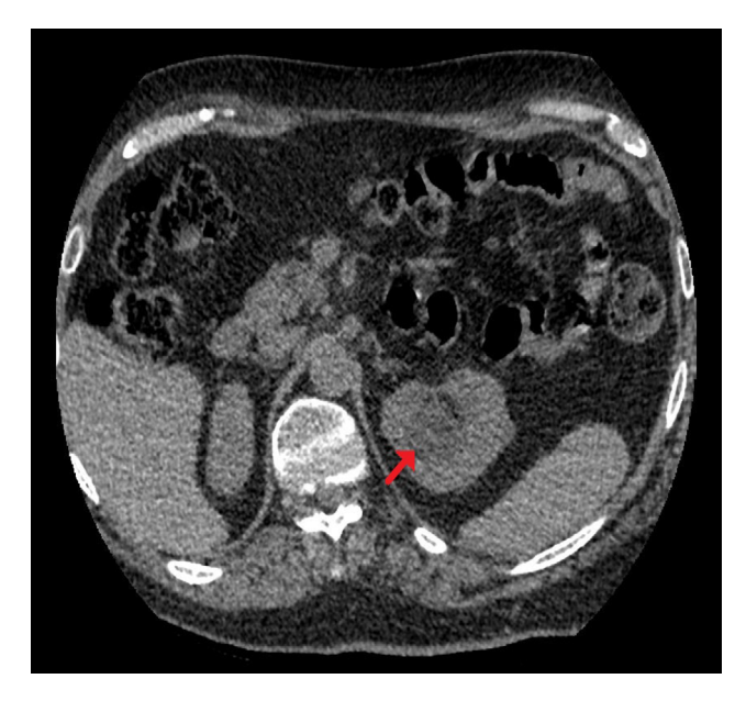
Figure 2 CT of urinary tract.