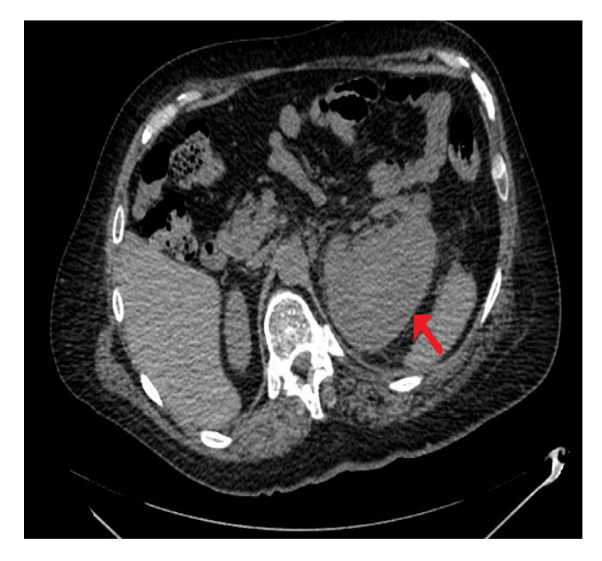
Figure 3 CT of urinary tract.

Note: Performed 4 weeks after the third ureteroscopy, axial section: 9×7 cm subcapsular collection on the left kidney compressing the underlying parenchyma present (arrow).