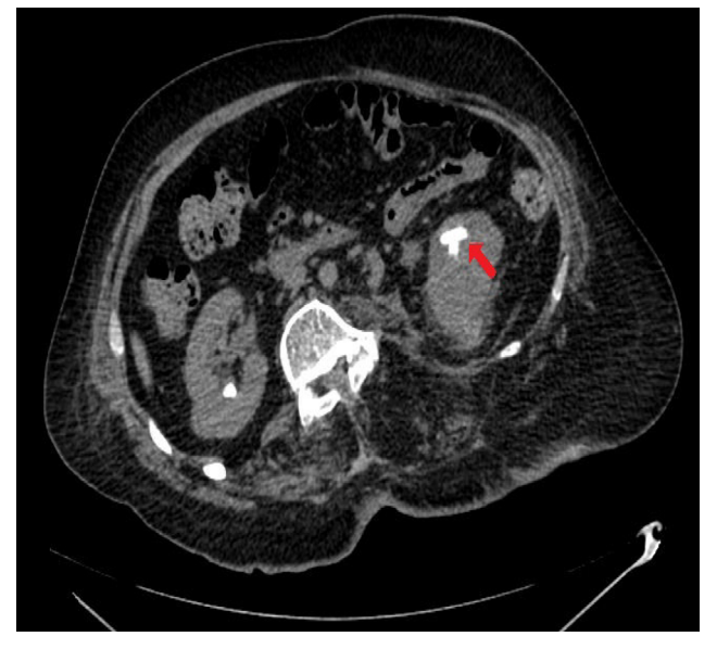
Figure 5 CT of urinary tract. Note: Performed 4 weeks after the third ureteroscopy, axial section: a few residual stones/fragments are seen in the lower pole calyces largest measuring 19 mm in size (arrow). Abbreviation: CT, computed tomography.

Isotope renogram, performed 8 weeks after the ureterorenoscopy, revealed deterioration in the left renal function because the study performed 7 months prior to the first ureteroscopy; the left kidney now contributed only 17% compared to the normal-looking right kidney, which contributed 83%. Renographic analysis, however, showed both kidneys were draining spontaneously without obstruction; renographic