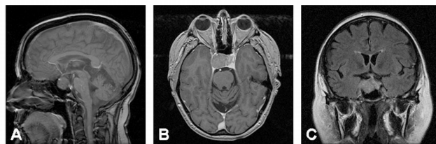
Figure 1 Pre-operative magnetic resonance imaging (MRI) of the head with and without contrast. Prior to endoscopic transnasal resection, midsagittal (A), axial (B) and coronal (C) MRI imaging reveal a homogeneous mass involving the sella turcica with extension into the right cavernous sinus which measures 2.8 cm × 2.1 cm × 1.7 cm. The mass does extend up into the suprasellar cistern, but does not impinge upon the optic apparatus. There is partial encasement of the cavernous internal carotid artery on the right side, but the caliber of the vessel is not compromised.

MRI imaging of the brain was obtained two months following tumor debulking. A persistent mass was noted