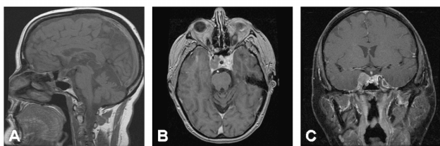
Figure 3 Post-operative MRI of the head with and without contrast. Midsagittal (A), axial (B) and coronal (C) imaging suggests an overall interval reduction of the size of the mass within the sella turcica. There is persistent tumor present within the right cavernous sinus. This has maximal measurements of 2.0 cm \times 1.3 cm \times 0.9 cm. The residual tumor partially encircles the right cavernous internal carotid artery in the same region. There is extension along the posterior cavernous sinus into Meckel's cave and along the dorsal superior clivus adjacent to the basilar artery. Additional extension is seen ventrally along the cranial nerves to abut the posterior optic canal.

By December 2004, the patient showed only minimal response to ketoconazole therapy (urinary free cortisol 264.5 \mu\text{g}/\text{day} (normal range < 45 \mu\text{g}/\text{day} )). A follow-up MRI of the brain revealed a marked increase in size of the pituitary mass to 2.4 \times 2.0 \times 1.9 cm from 1.1 \times 1.0 cm just six months earlier. She additionally noted the rapid development of a complete right 6 th cranial nerve palsy. Tumor debulking was again performed in February 2005 via a right frontotemporal orbitozygomatic approach. Final surgical pathology was consistent with an ACTH-producing pituitary macroadenoma. Postoperative stereotactic radiosurgery to the recurrent pituitary tumor was performed to 12.5 Gy. Despite a persistent right-sided ptosis and restricted upward medial gaze with the right eye, the patient noted some improvement in general functional status.