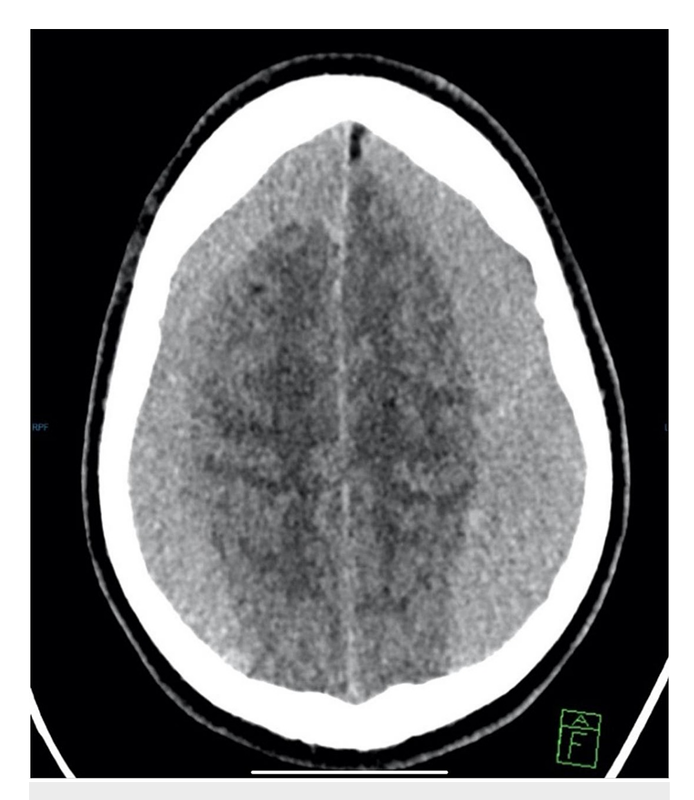
FIGURE 1: CT brain axial view: significant bilateral subacute subdural hematoma with significant mass effect on the brain cortex with effacement of the sulci and brain edema.