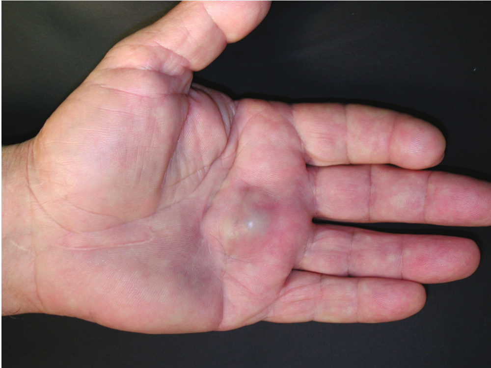
FIGURE 1: Lump in the region of heads of the 3 rd and 4 th metacarpal bone. A scar can be noticed proximally, on the palmar skin of the wrist.