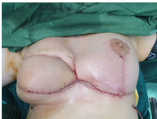
Figure 3: Flap division and reconstruction from contralateral breast