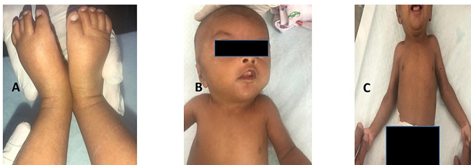
FIGURE 1: Clinical photographs of the neonate showing features of Turner syndrome (A: bilateral pedal edema, B: webbed neck, C: wide-spaced nipples).

For confirmatory diagnosis, chromosomal karyotyping, echocardiography, complete blood count (CBC), serum electrolytes, serum thyroid-stimulating hormone (TSH), ultrasound kidney, ureter, and bladder (KUB), and brain were performed. Chromosomal analysis of the patient showed a TS variant of 46.X, i(X)(q10){20} (Figure 2).