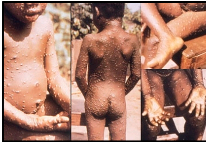
Figure 3. Monkeypox rash.

Chickenpox lesions tend to be more superficial, smaller and unlike the centrifugal distribution of MPX they are centrally located and evolve in ‘crops’ over 3–5 days, compared to the average 12 days for MPX [34]. Thus a slower maturation of skin lesions is an important differentiation when analyzing skin lesions [7]. It should be noted that not all MPX cases present with multiple lesions. In the USA epidemic, a 28-year-old female who had direct contact with an infected PD and went on to develop prodromal symptoms followed by lymphadenopathy (and later tested positive for MPXV in serologic testing) presented with only one lesion [19,38]. Furthermore, no ‘crust’ stage was described by the patient [38]. This case highlights the weakness of clinical recognition alone (a frequent reality for endemic countries) when diagnosing OPXV or differentials. In endemic countries, mucosal lesions or unusual eruptive skin rashes associated with pronounced lymphadenopathy, gastrointestinal symptoms and hematologic abnormalities, should include MPX in the differential diagnosis [35].