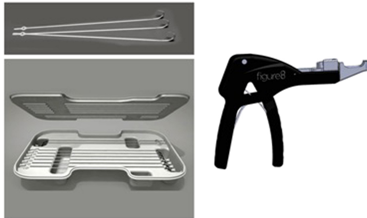
Figure 1 FlatWire sternal closure system. The Figure 8 FlatWire Sternal Closure System comes packaged with 6 straight and 2 X designed FlatWires. A reusable tensioning device is provided to tighten the straps and re-approximate.