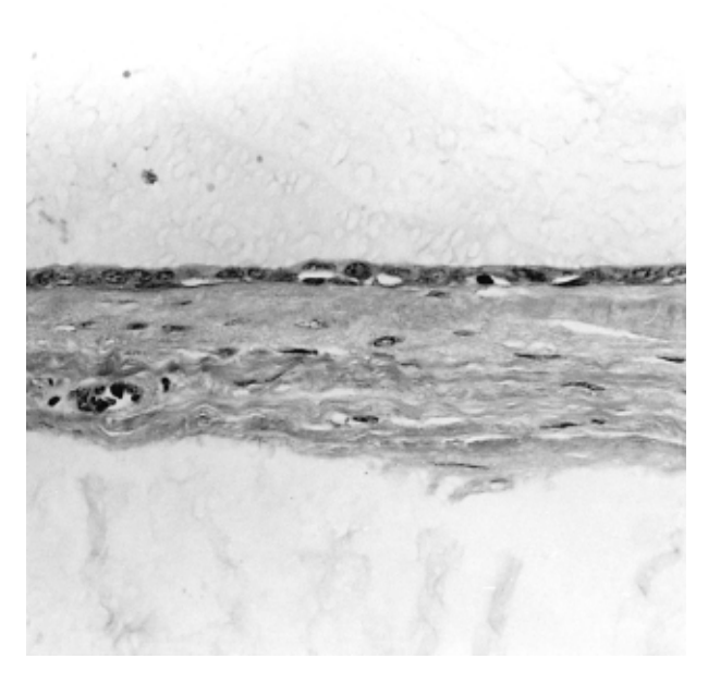
Fig. 2. The lining cells of cysts are usually flat (H&E, \times 400).