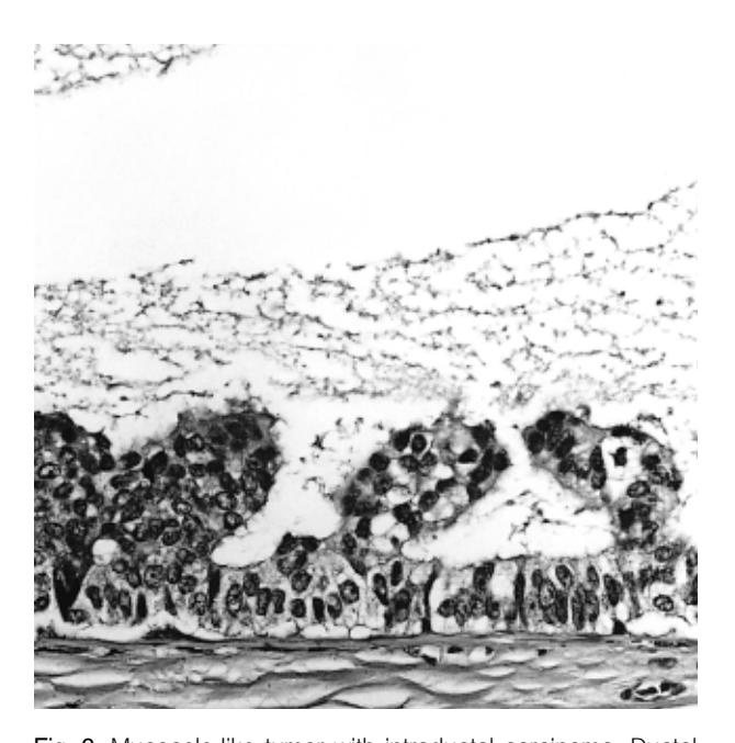
Fig. 3. Mucocele-like tumor with intraductal carcinoma. Ductal carcinoma in situ of micropapillary type is present (H&E, \times 400).