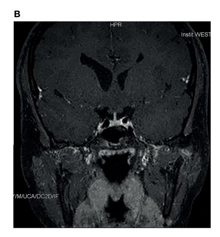
FIGURE 1 | Pituitary magnetic resonance imaging of this patient. Sagittal magnetic resonance imaging scans of this patient (A) indicated dysgenesis of the corpus callosum, and a small nodule in septum pellucidum. Coronal scans of this patient (B) indicated nothing abnormal.