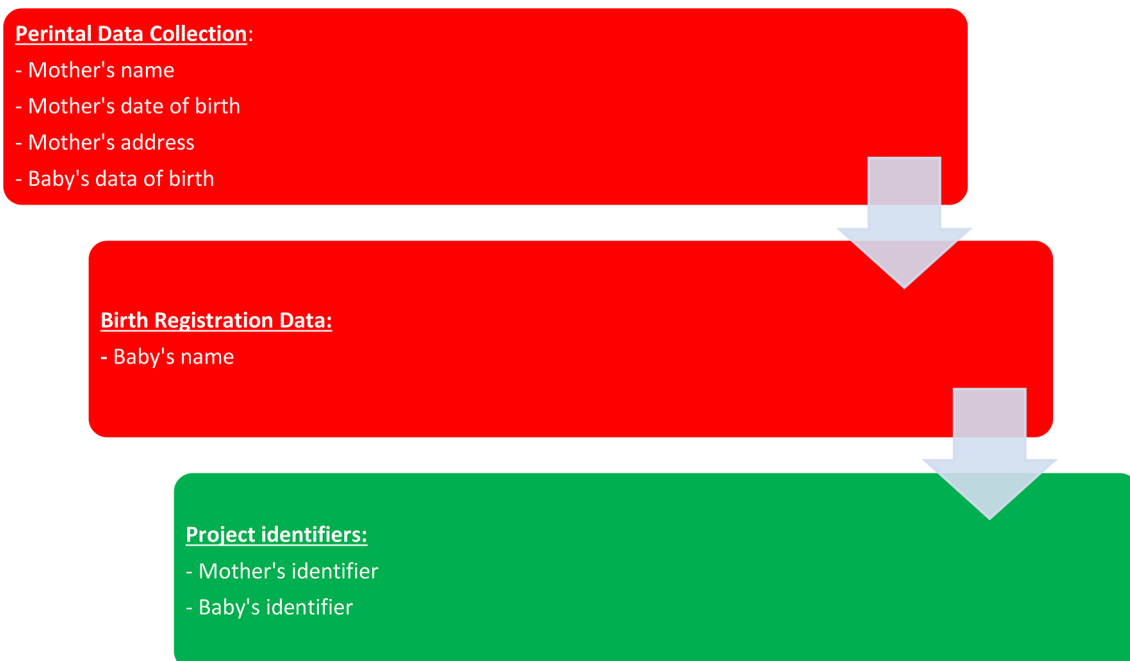
Figure 1 Variables used to identify cohort (shown in red), and identifiers provided to researchers (shown in green).

The SSB will provide the AIHW with the identifying variables and project identifiers shown in figure 1. The AIHW will then link MBS and PBS claim records from