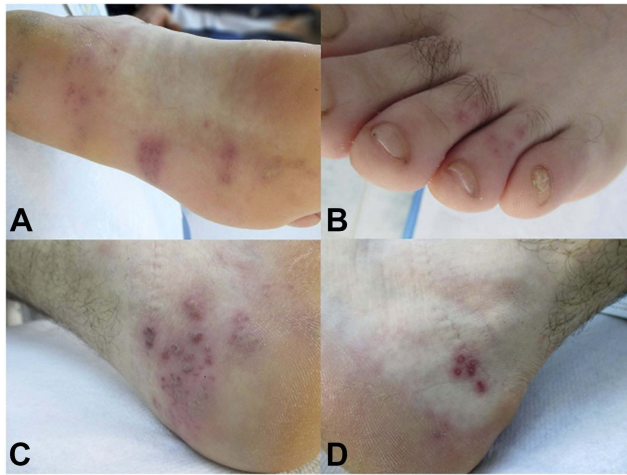
Figure 1 Clusters of vesicles located on the lateral plantar area (A), dorsal surface of digits III and IV (B), lateral aspect of the calcaneus (C and D).

The person's immune status is a key factor in determining the risk of developing herpes zoster; this can be induced by contact with a person with varicella or by reactivation of the virus in latently infected individuals. The reactivation rate of herpes zoster virus correlates with the decrease of immunity and with age. 6