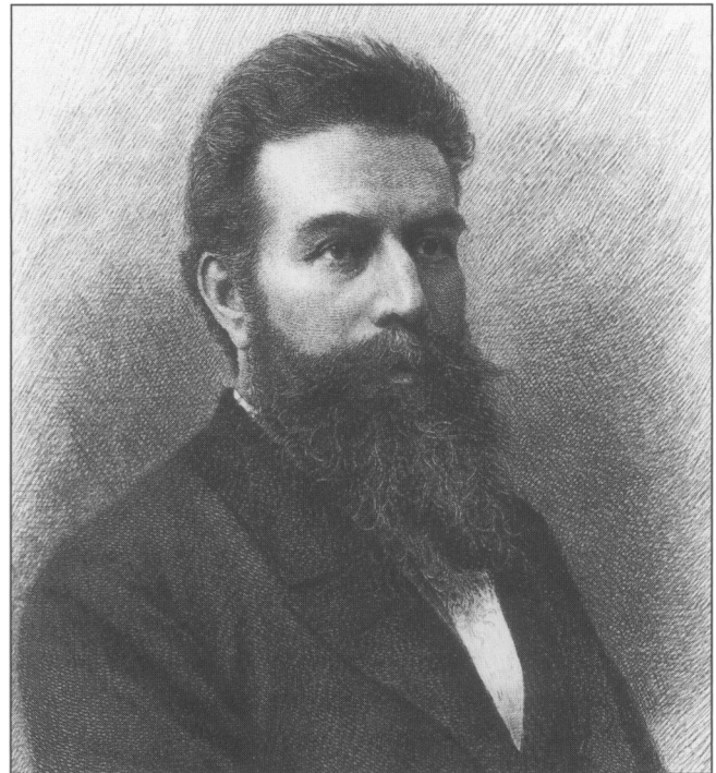
Fig 7. W C Röntgen, Professor of Physics at Giessen, Wuerzburg and Munich, discoverer of X-rays.

At the end of the century Röntgen (Fig 7) discovered X-rays 15 and this resulted in huge advances in diagnosis and treatment. Pasteur and Röntgen were responsible for advances in medicine, which are as well known to the general public as to doctors, but neither was medically qualified. Pasteur was a chemist and Röntgen a physicist. There are many other examples of scientists contributing greatly to medical knowledge. This is likely to be an increasing feature of future medical advances. However, science has become so complex and so specialised that it is impossible for the average doctor to keep up with, let alone advance, the scientific basis of medicine.