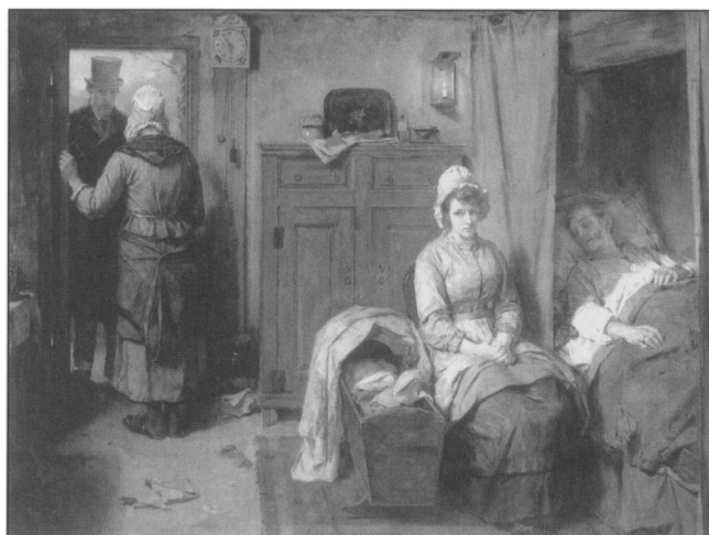
Fig 1. 'The Doctor's Visit' by Thomas Faed, painted in 1889. This painting is part of the Queen's University of Belfast collection and hangs in the King Edward Building of the Royal Victoria Hospital.

What was medicine like at the beginning of this century? Two paintings of the time give us some information. The first, the 'Doctor's Visit' by Thomas Faed, belongs to Queen's University and hangs in the foyer of the King Edward Building at the Royal Victoria Hospital (Fig 1). Painted in 1889, it shows the doctor calling at the home of a patient, a man who is clearly very ill in bed, attended by his wife, with a child nearby. At about the same time, in 1891 Sir Luke Fildes painted the picture entitled 'The Doctor' which hangs in the Tate Gallery. Here the doctor is within the home, the patient is a child, and the family is in attendance. A feature of both these portraits is that the doctor comes to the patient's home, what would now be called 'care in the community'. The doctor does not have a bag full of drugs or a prescription pad. What he has is time to spend with the patient. What would be the picture of the doctor today? The television programme 'ER', is perhaps somewhat theatrical but nevertheless illustrates a public perception of medicine. The doctors are young, full of