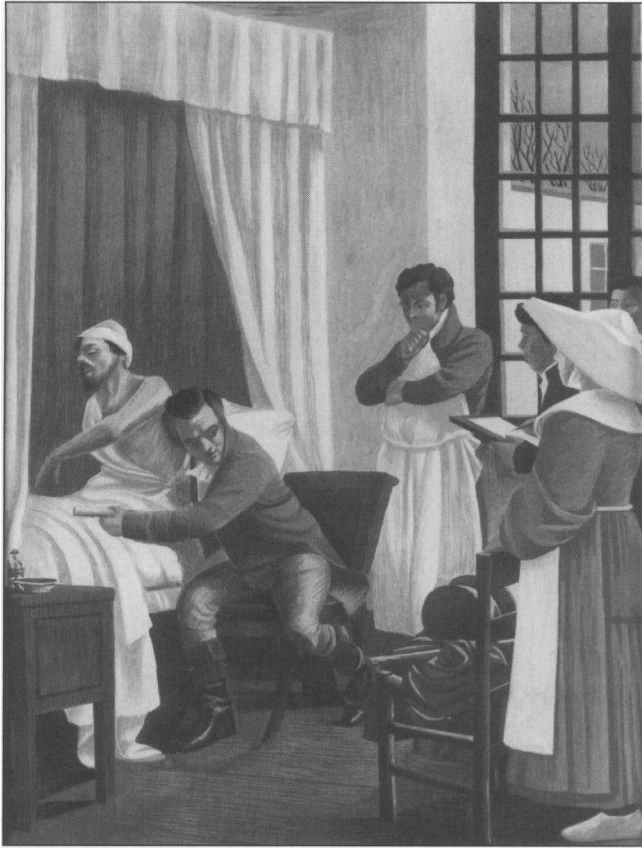
Fig 5. Direct auscultation.

to keep himself at a distance from her that he rolled up the piece of paper but because he was aware that sounds often were transmitted better by a piece of material. Of course, since then the stethoscope has become not only an essential diagnostic tool, but the badge of office of doctors everywhere. Until the second world war, nurses were not allowed to take blood pressure because that required the use of the stethoscope and the stethoscope was regarded as an exclusively medical skill. It wasn't simply the invention of the stethoscope for which Laennec's reputation developed, but because of the use he made of it to explore disease.