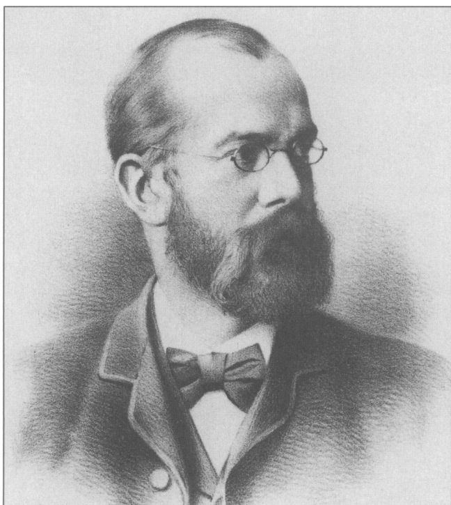
Fig 6. Robert Koch, Lithograph, 1891. Wellcome Institute Library, London.

Pasteur of course did not discover the organism which causes tuberculosis. This was the achievement of the German pathologist, Robert Koch 12 (Fig 6). Koch graduated in medicine with honours at the University of Gottingen, a leading medical school at the time, and he went into rural general practice in the small Prussian town of Wollstein. On his 28th birthday his wife surprised him with a present that was to change their lives. She gave him a microscope. The microscope had been developed 300 years before chiefly by Leeuwenhoek. Koch's microscope was by